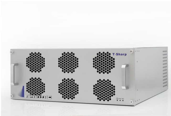
Apantac T# Multiviewers with UHD Outputs

For more information about Apantac's products & services please visit: www.apantac.com . For sales, please visit the website , or email thomas.tang@apantac.com . More information: Facebook , Twitter , and LinkedIn .